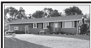
55465 Hwy 121 Crofton, NE