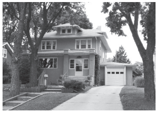
521 Maple St., Yankton $205,000

New lake area 3-bedroom, 2-bath with 1560 sq.ft on 1-acre. Vaulted ceilings, 2-covered decks. Lots of upgrades. Call Leslie Kuntz, Lewis & Clark Realty, Inc. 605-661-2647.