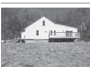
902 Beemer • $121,500