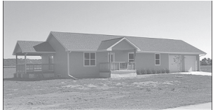
306 Lillie Lane $234,350

13 acre hobby farm in Vermillion. Large home with 6 bedrooms, 4 baths, built in 1912. Machine shed, corn cribs, garages, large barn and corral perfect for horses. 605-661-2509.