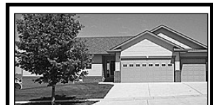
1702 West Street

17 Acres, 2900 square feet, 4-bedroom, 2.75-bath, 3-car garage, outbuildings, 42252 307th, Tabor, $249,900, Joe, Americas Best Realty. (605)661-7264.