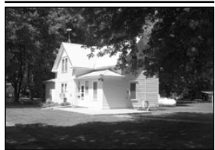
100 Finnoti, Mission Hill $55,500

Affordable starter home Very well cared for home, 3-bedroom, 1-bath, main floor laundry, detached single garage+shed, well-maintained 100x150 corner lot, just minutes from Yankton, Leona Sparks, (605)660-6078, Anderson Realty