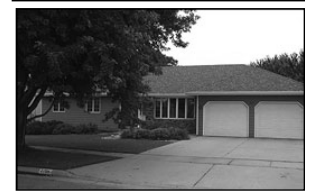
2704 Pine * $199,900

4-bedroom, 3-bath, new appliances, large fenced backyard, oversized double garage, shop area in garage. Quiet neighborhood, recently painted, new roof. Call cell (605)-660-0305 home (605)664-7705. www.yankton.net/2704pine