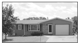
113 Curlie St. • $109,000

Affordable starter home Very well cared for home, 3-bedroom, 1-bath, main floor laundry, detached single garage+shed, well-maintained 100x150 corner lot, just minutes from Yankton, Leona Sparks, (605)660-6078, Anderson Realty