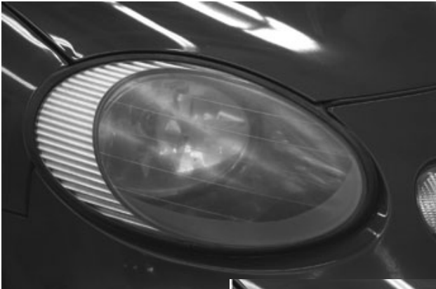
Headlights before (left) and after (below) renewing the lenses.

Additionally, 3M is proud to support City of Hope, one of the nation's leading research, treatment and education centers for cancer and other life-threatening diseases, with a cause-related marketing program. For every headlight or lens restoration kit from 3M purchased at participating retailers starting September 1, through December 31, 2010, 3M will donate $1 to City of