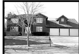
905 W 13th $379,000

This is better than the house you dreamed about with over 4,000 sq ft finished! Great floor plan. Spacious master suite with sitting area & closets galore. Huge 3 car garage on a nicely manicured lot. Lisa, Anderson Realty, LLC (605)661-0054