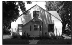
201 S. East * Menno $29,000

1600sq.ft. on main floor, fully finished walk-out, 5-bedrooms, 4-baths. Without a doubt the most new house for the money. Will consider a trade. $289,800. Call Jim Tramp (605)661-2192