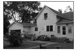
31371 453rd Ave. Gayville $169,900

3-bedroom, 2-bath, split level. Natural gas, 2-stall, new carpet/appliances. Price reduced $122,900. 108 Curlies. (605)661-9078