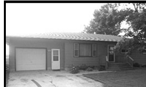
807 Burleigh-Gayville $89,900

4-bedroom, 2-bath with over 1600 sq.ft. finished! Huge master, nicely updated & new shingles in 2011. Lisa, Anderson Realty, LLC (605)661-0054.