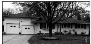
1904 Burleigh $128,900

2-bedroom, 1.75 bath, 1000 sq. ft. Garage, Not a drive by. Joe, Americas Best Realty. (605)661-7264.