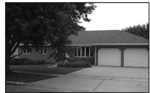
2704 Pine * $199,900

6-bedroom home with updates, corner lot. (605)661-8643 Carla, Century21.