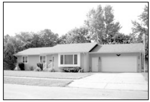
1405 Ash St. New Price $110,900

One owner home-built '94, 3-bedroom, 2-bath, Chuck's Kitchen cabinets, mainfloor laundry, unfinished basement (egress), insulated/heated garage, fenced lot/sprinkler system, Leona Sparks, (605)660-6078, Anderson Realty