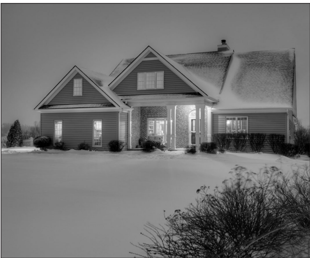
For a more extensive winterizing project, consider renovating your home with insulated siding such as Variform by Ply CSL 600 shown here.

"Homeowners don't just want energy efficiency, they want their home to look better and they also want to min-