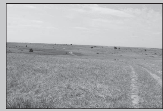
320 Acres Knox County Northwest of Verdigre, NE