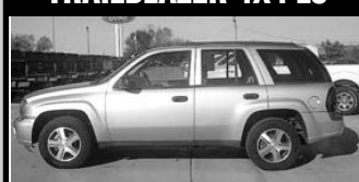
Silver, V6, nice