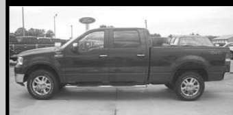
Lariat, 34,000 miles