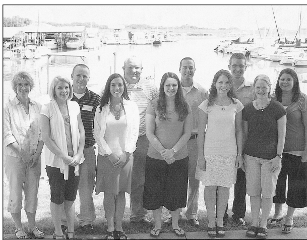
Yankton School District New Teachers 2009-2010