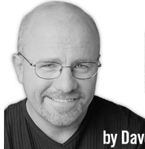
by Dave Ramsey www.davesays.org