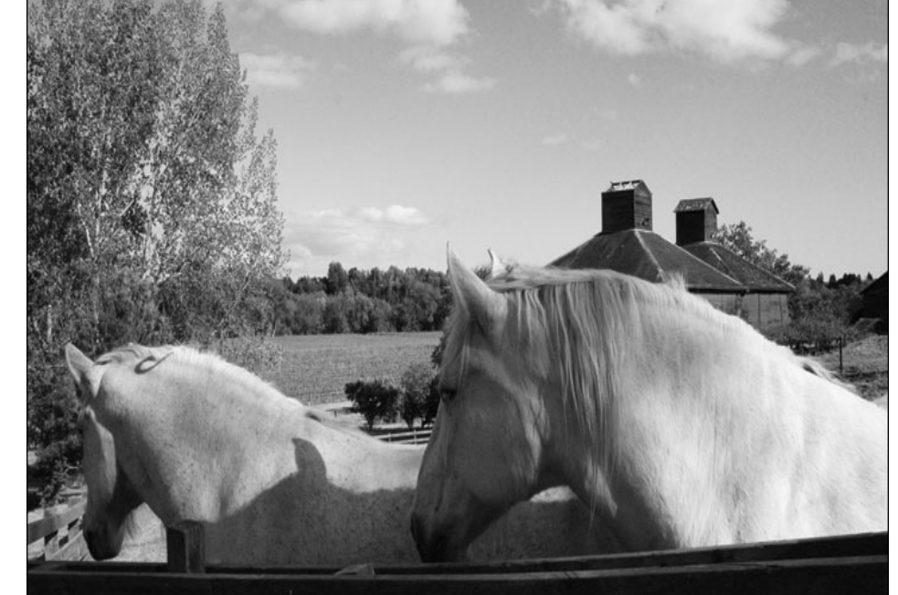
Though fun places to visit, farms pose many hazards to children. Parents must emphasize safety when visiting farms with kids in tow.

measures parents can take include keeping kids away from stallions, bulls, boars, and rams, and emphasizing the importance of having an accessible escape route whenever working with