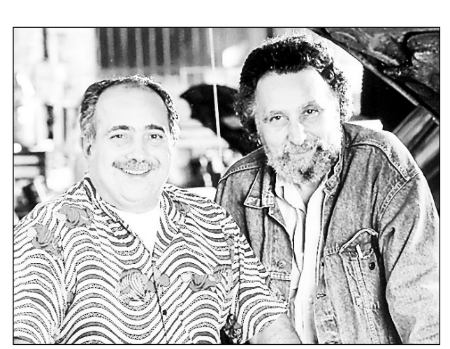
CLICK & CLACK

Dear Tom and Ray: Hello! My older sister has a 1996 Saturn SC2, and she is constantly yelling at my sister, my mom and myself for supposedly "plopping" into the seat. She claims that because we don't carefully control our muscles while we get into the car, the impact from our weight falling into the seats will harm the shocks. I don't believe this at all. Also, I don't think that I am getting into the car so clumsily. I think she is mistaking the feeling of the car slightly sinking when more weight is added for my being careless when getting into the car. It's at the point