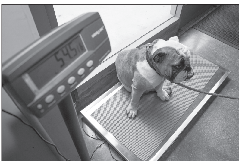
A veterinarian assistant weighs a bulldog, Biff, at DTLAvets in Los Angeles. According to a recent study, more than 50 percent of cats and dogs in the country are overweight.