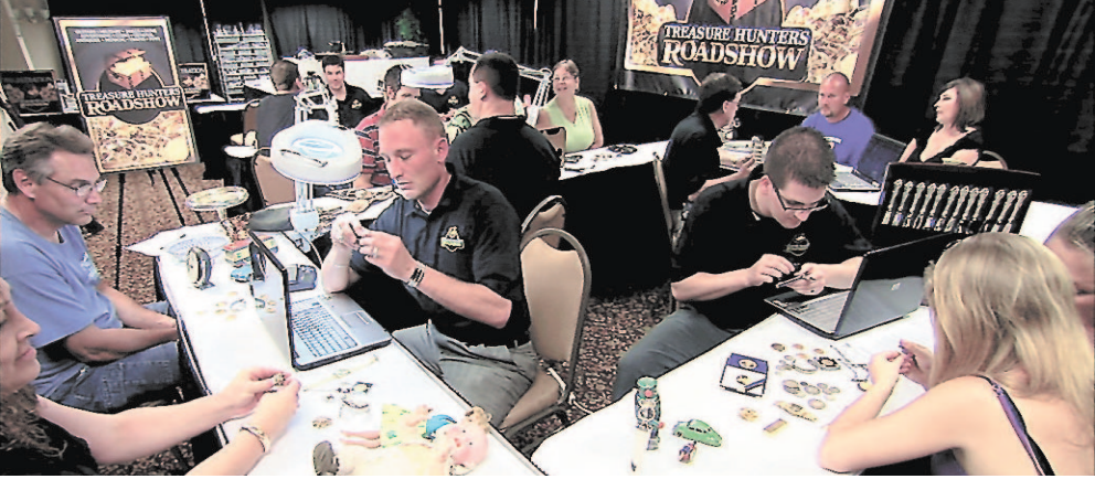
Above • Clean out those attics, basements and lock boxes and get ready to CASH IN.

"It's a Modern day gold rush as precious metal prices soar due to weak economy. It's a sellers market." says Archie Davis Roadshow representative.