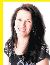
By Jill Cataldo CTW Features

Q: "My mom and I get different newspapers, and she saves her coupon inserts for me each week. I have noticed that the coupons that come in her paper are often different from the ones that come in mine. The coupons are usually for the same products but the dollar amounts are different! On the same day we both had coupons for automatic dishwasher detergent. My newspaper had a $1 coupon. Her newspaper ran the same ad with a $5 coupon for the same product. Is this normal?"