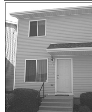
2912 Lakeview Drive #6. Yankton

2-bedroom, 3-bath, townhome with garage located in great neighborhood. 1,100sq.ft. finished living area. Move in condition! Price Reduced $79,900. Call (605)661-5561 For more pictures and informawww.yankton.net/2912lakeview6