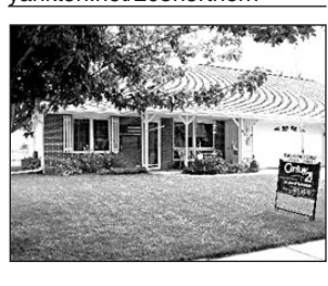
2220 Valley Road

2-bedroom, 1 1/2-bath twin home. Motivated sellers, reduced price only $150,000! Emma, Century21 (605)661-2224.