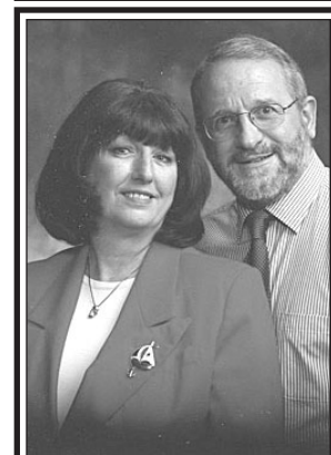
Homes for Sale:

44475 South Jim River Road. $164,900 Ranch style home on 2.45 acres.