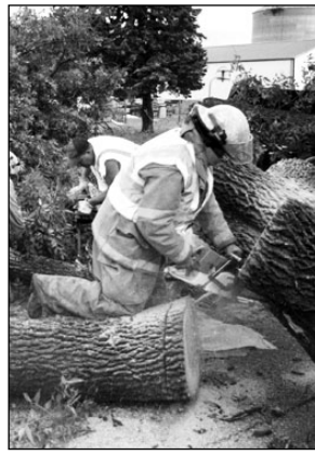
church grounds in Fordyce. The theme of St. John's celebration is "Heart of our Community."

Emergency crews worked to clear the downed trees and limbs in Menno last night after a powerful storm pounded the Hutchinson County community. The region saw a night filled with warnings and reports of tornados, hail and severe thunderstorms. St. John the Baptist Catholic Church in Fordyce, Nebraska will be celebrating their 100th birthday. They will celebrate their early beginnings June 20-21 on the