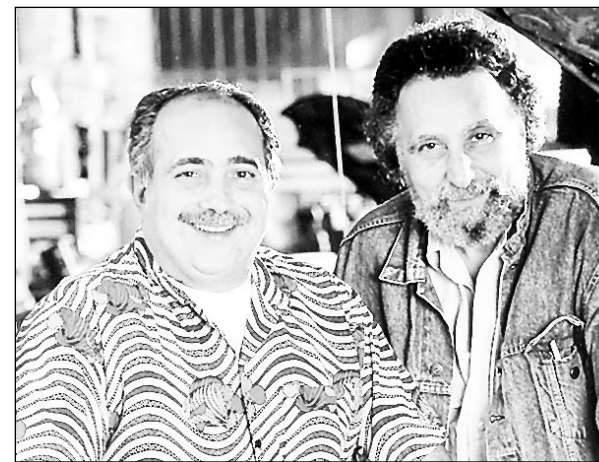
CLICK & CLACK

RAY: If you then turn the front wheels to the left and drive the car in a circle, the right, front wheel will make the largest circle — near the outside wall, behind where your sofa used to be. That means it's traveling farther — and faster — than any other wheel. The left, rear wheel will make the smallest circle, and travel the least dis-