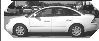
#146331, 4 door, White, V6, AT, PS, AC, CD