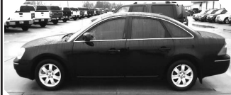
#101567, Black, V6, AT, PS, air, cruise, P/W/L/S