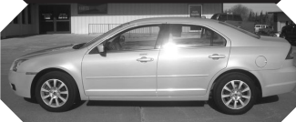
#611157, 4 door, Sage, 4 Cyl., AT, PS