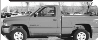
#283779, Red, 318 V8, AT, PS, air, tilt, P/W/L