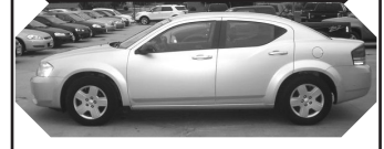
#174747, 4 door, Silver, 4 Cyl., AT, PS, AC, CD