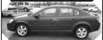
#120263, 4 door, Grey, 4Cyl., 56K, AT, PS, AC, CD