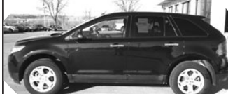
#A88455, 4 door, Black, 3.5L, V6, AT, PS, air, tilt, cruise, P/S/W/L