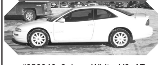
#056646, 2 door, White, V6, AT, PS, AC, CD, leather, moonroof