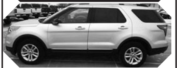
#A19455, 4 door, Silver, 3.5L, V6, AT, PS, air, tilt, cruise, P/L/W/S