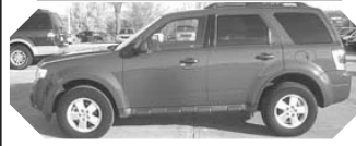
#B92404, 4 door, Red, 3.0L, V6, AT, PS, air, tilt, cruise, P/L/W/S