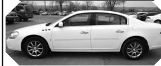
#205935, 4 door, White, 3.8L, V6, AT, PS, AC, tilt, cruise, wheels