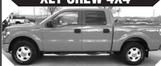
#B11022, Red, AT, PS, air, tilt, cruise, P/L/W, T-Tow