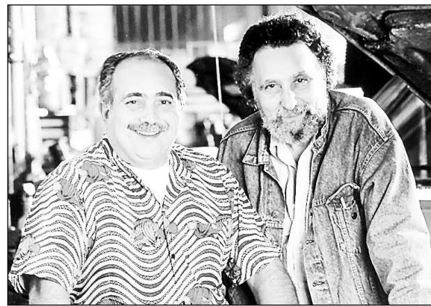
CLICK & CLACK