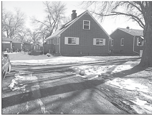
810 Linn $154,900

7-bedroom, 2-car garage, & large detached garage. This nearly 4,000 sq.ft. home is conveniently located near West Side Park, the hospital, YHS, Lincoln Elementary. Call Rick, Anderson Realty 605-760-9976.