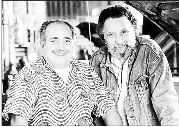
Click & Clack

at a fairly high speed. And, as I'm sure you can attest, Ted, it causes a loss of control. Not only of the car, but sometimes of your bodily functions. It's scary! RAY: Normally, hydroplaning is prevented by the tread design of your tires. The tread contains grooves that channel the water through the tire, leaving the surface of the tread firmly on the road. TOM: So one possibility is that you simply don't have enough tread left. If your tires are old and worn down, and the channels aren't deep enough, you won't be able to move water through the tires quickly enough, and you'll hydroplane. RAY: Hydroplaning also can be caused by worn-out shocks that aren't doing their job of keeping the tires pressed down against the roadway. That makes it easier for water to push the tires off the road surface. TOM: And if your tires and shocks haven't been changed since 2005, either or both could be the cul-