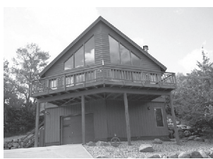
101 Crestview $299,000

J&V Storage: 10x20 and 10x30 units available. Call 605-668-0694 or 605-655-4521.