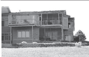
203 Calumet Drive $439,900

For all your real estate needs, contact Kami or Dan Guthmiller 605-660-2147 605-660-2740 Lewis & Clark Realty