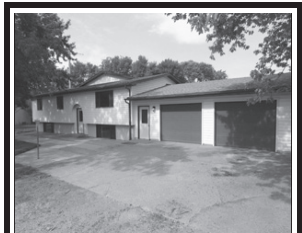
148 Dayton Lane (Deep Woods) Price Reduced $254,500

1300 Fir Tyndall-3 BR 1 bath Double garage, near school & clinic. Only $45,000! L&C Realty, Call Emma 661-2224.