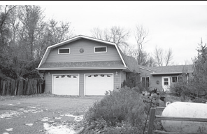
383 Lewis & Clark Trail $179,900

4-bedroom, 2-bath, fireplace, 3-season room, Jolene, Century 21, 605-464-9634.