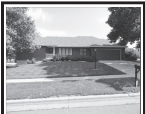
2206 Burleigh On Hillcrest Golf Course $262,000

4 bedroom, 4 bath townhome. Open floor plan, 2 fireplaces, 3 season rooms. Fabulous water views. Stan Sudbeck 402-841-5885. Lewis & Clark Realty, Inc.