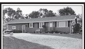
55465 Hwy 121 Crofton, NE