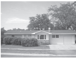
304 W. 16th Ave. Tyndall $89,500

Spacious country home, 4-bedroom, 3-bath, ranch. Jolene, Century 21, 605-464-9634. 2805DeerBoulevard.C21.com