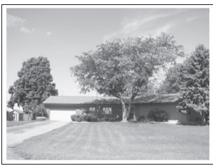
2805 Deer Blvd $224,500

Beautiful townhome on Hillcrest Golf Course with fabulous views of #2 fairway and courtyard. 2600+ square feet, main floor master and laundry. Call Kami Guthmiller Lewis & Clark Realty 605-660-2147.