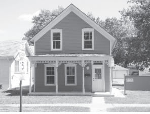
412 Douglas • Yankton $115,000

Lake area 3 bedroom, 2 bath with updated kitchen, fireplace, hot tub, large deck. Large wooded lot. Stan Sudbeck 402-841-5885. Lewis & Clark Realty, Inc.