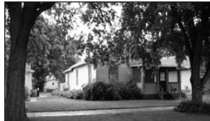
510 Linn * $70,900

This is a very well kept 2-bedroom, 1-bath home. Conveniently located one block off Broadway. (605)661-8118. www.yankton.net/510linn