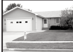
640 Augusta Circle $139,900

New twin home. Quality built, no step design. Beautiful hardwood. 2-bedroom, 2-bath, laundry on main. HOA. List Construction (605)661-8003.