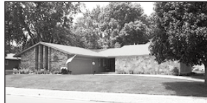
2213 Mulberry - $223,900

Awesome location, 3-bedrooms on main, 2-bath, full basement, oversized garage. New shingles, (seller to install new shingles buyers choice) Lisa, Anderson realty, LLC (605)661-0054.