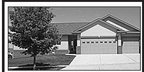
1702 West Street

17 Acres, 2900 square feet, 4-bedroom, 2.75-bath, 3-car garage, outbuildings, 42252 307th, Tabor, $249,900, Joe, Americas Best Realty. (605)661-7264.