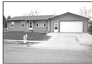
2400 Cedar Terrace $129,000

Across from 1st Tee at Hillcrest Country Club. 3-Bedroom, 3-Bath, Four Season room with hot tub. Call (605)665-8149. See at www.yankton.net/2213mulberry