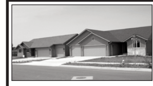
New Homes for sale built by Jim and Jason Tramp 806 and 810 Rylee Way

Lots: Golf Course, Beaver Lake Shorefront, will build to suit. List Construction Call (605)661-8003 or 661-7643