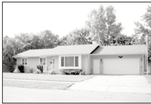
1405 Ash St. New Price $110,900

One owner home-built '94, 3-bedroom, 2-bath, Chuck's Kitchen cabinets, mainfloor laundry, unfinished basement (egress), insulated/heated garage, fenced lot/sprinkler system, Leona Sparks, (605)660-6078, Anderson Realty