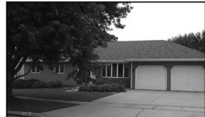
2704 Pine * $199,900

4-bedroom, 3-bath, new appliances, large fenced backyard, oversized double garage, shop area in garage. Quiet neighborhood, recently painted, new roof. Call cell (605)-660-0305 home (605)664-7705. www.yankton.net/2704pine