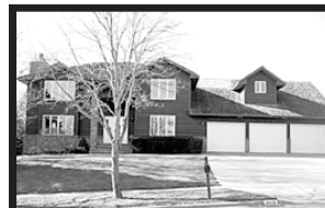
905 W 13th $379,000

3-bedroom, 2-bath brick home in great neighborhood. Call Bill Conkling (605)660-0618 Lewis and Clark Realty, Inc