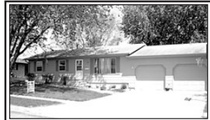
206 Golf Lane * $115,000

Awesome location, 3-bedrooms on main, 2-bath, full basement, oversized garage. New shingles, (seller to install new shingles buyers choice) Lisa, Anderson realty, LLC (605)661-0054.