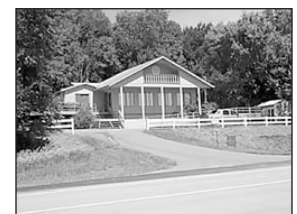
43384 SD Hwy. 52

2-bedroom, 1.75 bath, main-floor laundry, wood floors, double garage, finished basement $113,500. Joe, Americas Best Realty (605)661-7264